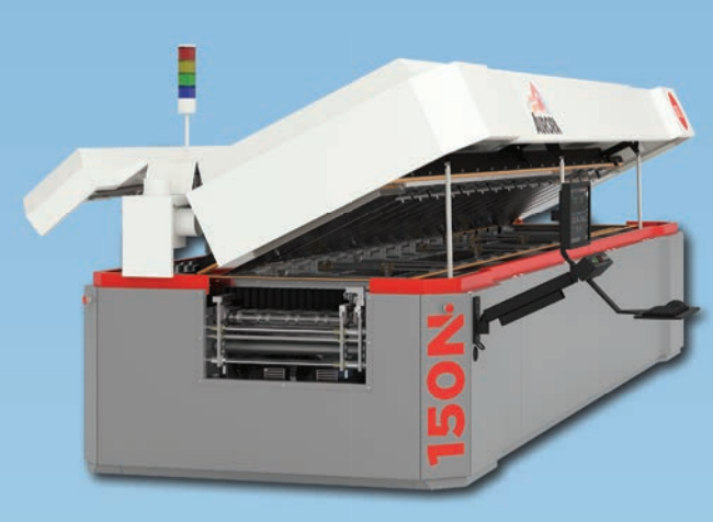
Fully accessible process chamber