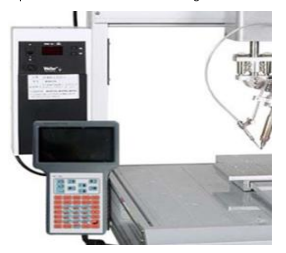
Flexible operation, simple programming, fast switching between different products.