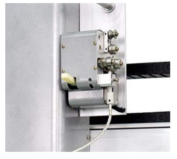
Special structural design ensures good supply of tin wire, no broken wire, stuck and other problems.