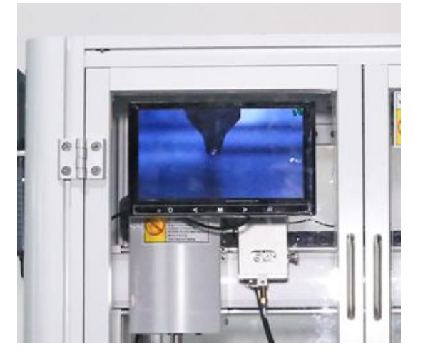
Vision options to monitor the soldering effect throughout the process, and can handle high-precision product soldering.