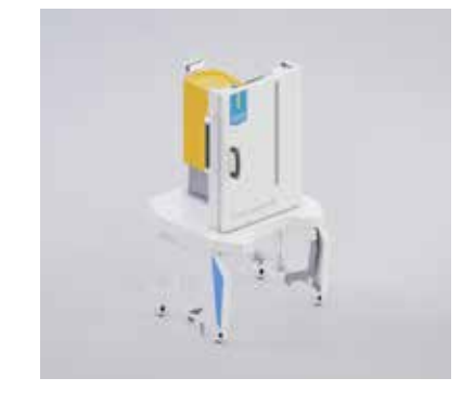
ISM UltraFlex CASE Carrier

Elevator modules that enable fully automatic loading and unloading of components.