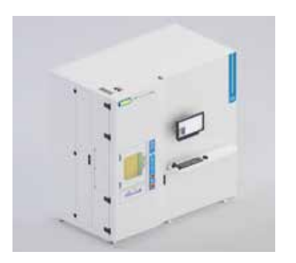
ISM UltraFlex 3600 Independent or integrated tower systems, with a capacity of up to