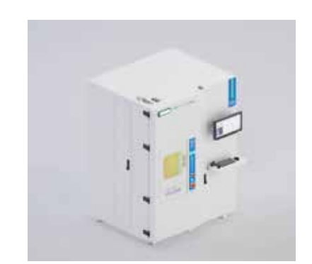
1800 Low-capacity systems suitable for industrial settings with lower production volumes, up to 1800