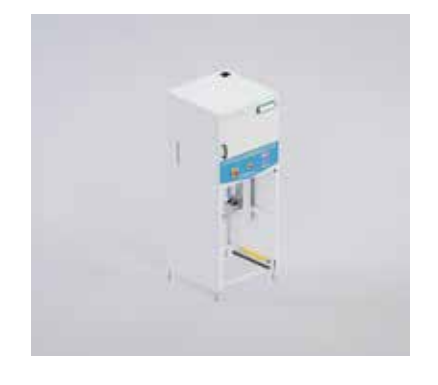
ISM UltraFlex EMM

Connection system between storage warehouses and elevator modules.