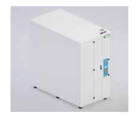
ISM UltraFlex 3900