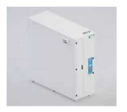
ISM UltraFlex MIM

Connection system between storage warehouses and elevator modules.